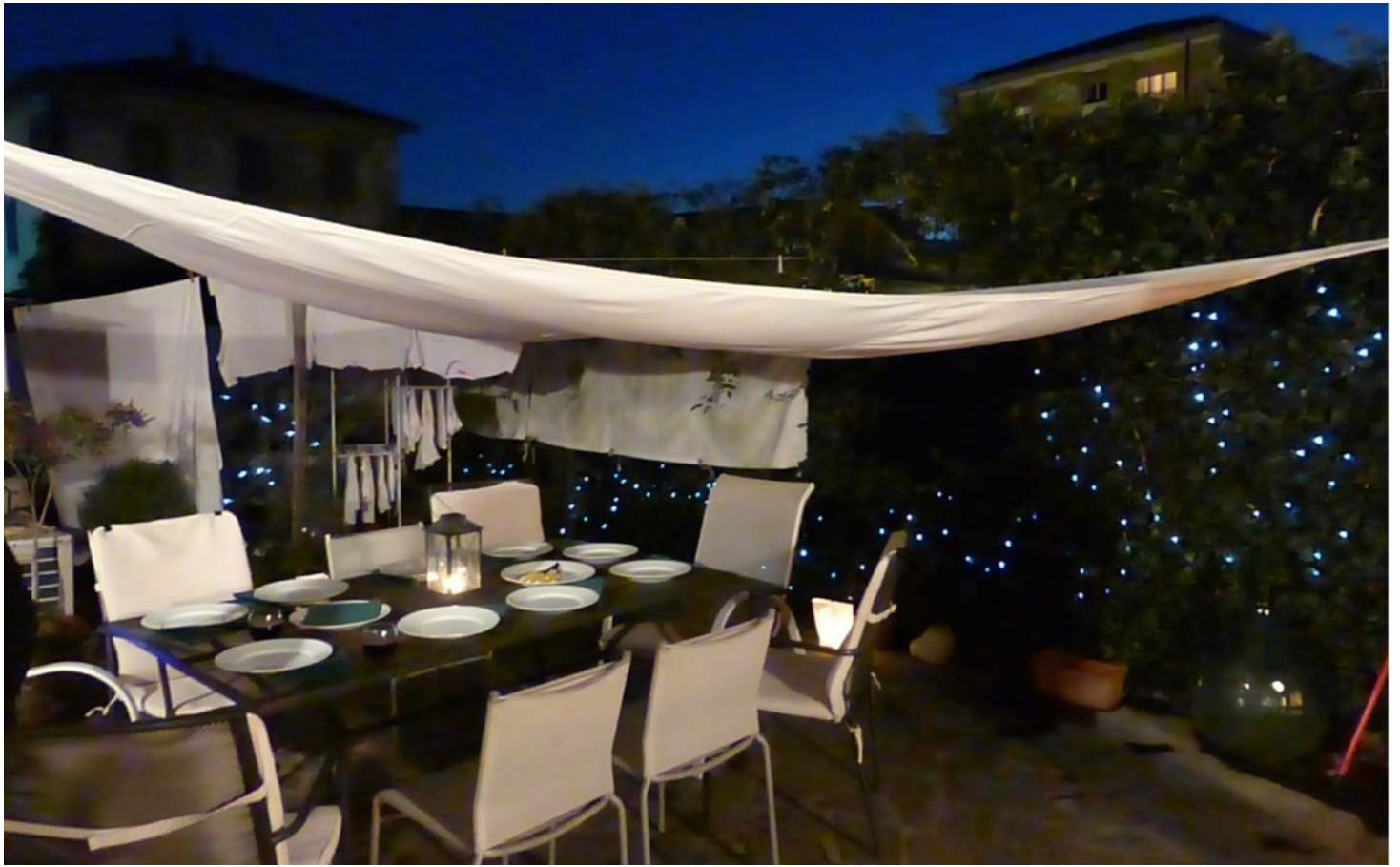
Wood fired pizza night!