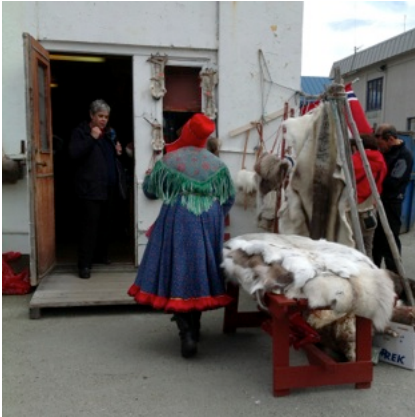
Left and below:

Amazingly, the town of Honningsvåg dates back 10,000 years and further surprises the visitor with its very mild temps along the ice-free Barents Sea. Fishing, oil, tourism and serving as a final town for greater Arctic expeditioning are the main industries of both Honningsvåg and Hammerfest to its west. What surprised us both were the abundant gardens and wildflowers in Honningsvåg, due to the mild gulf stream air that most of the Norwegian coastline enjoys. We took our time and simply relaxed with good hikes in both of the small Arctic cities of Honningsvåg and Hammerfest ~ the main event for us was late each evening enjoying the Midnight Sun!