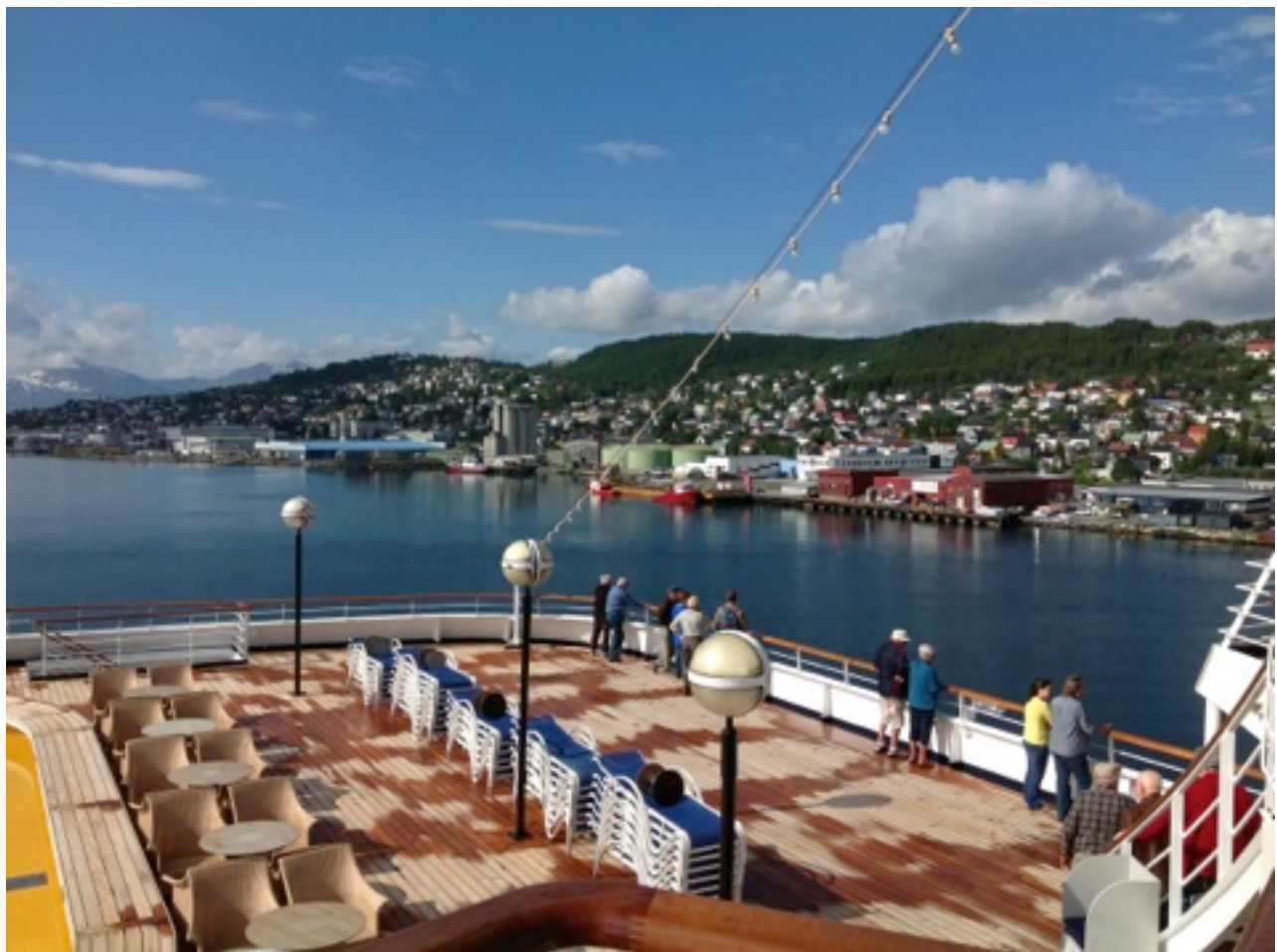
Above: Waking up to the coast of Tromso