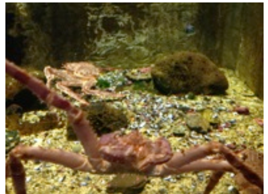
Above: A few red king crabs as part of the large population of huge king crabs now to be found in the Barents Sea of northern Norway ~ yum!