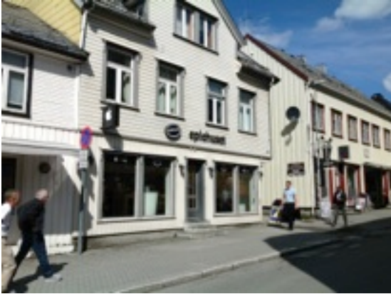
Above: Central Tromsø and the traditional wooden houses and shops of northern Norway

Tromso has much to see and enjoy, so definitely do not judge the city by my lack of photography! We spent our day largely indoors at The Polar Museum, Polaria Museum and also in the lovely Art Museum of Northern Norway.