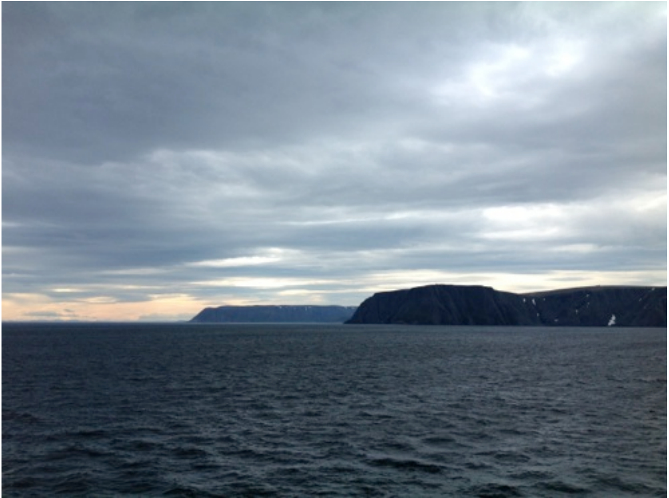
Above: Our first sailing around the Nordkapp (the North Cape) as we headed east and around the corner to Honningsvag in the morning hours. Seen above is the northernmost point in the European continent.